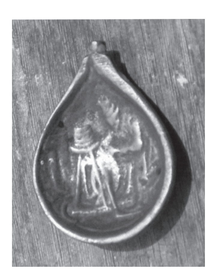
Figure 2. Metal object found in Apoloaca, located on the right margin of the Caurés river, between Igarapé Peixe-Boi and Igarapé Gregório. Measurements: 44 x 30 mm.

Arawak communities of the Negro river basin reached a higher stage of technical development when compared with other neighbouring cultures. This conclusion is supported by elaborated pottery, weaving work, community buildings and agriculture (RIBEIRO 1996; HECKENBERGER 2002). Horticultural and agricultural practices developed by Arawak groups probably induced changes in the ecological succession of plant communities of the forest, when they abandoned their settlements following the European colonisation of the 17th century. Ecological and archaeological evidence suggests that pre- and post-Columbian settlers at the confluence of the Caurés and Negro rivers managed at least some of the forests and influenced their floristic composition (Guix 2005).