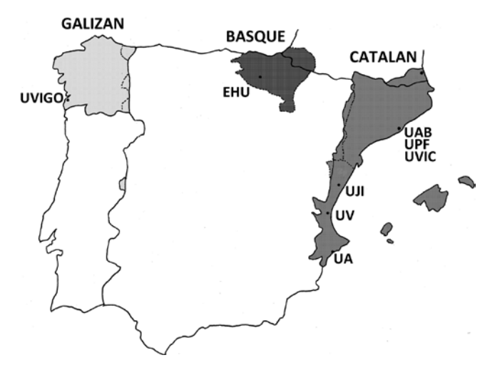
Figure 1. Universities offering undergraduate T&I courses in the co-official languages.

The following simplified map (adapted from Radatz & Torrent-Lenzen 2006: 88) shows the areas where the three co-official languages are spoken together with the location of the universities providing undergraduate Translation and Interpreting (T&I) courses in these languages (for the abbreviations see the relevant sections below).