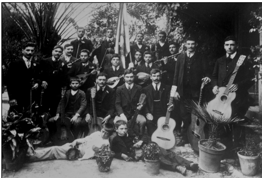
Picture 1: Tuna Souselense in 1910

This research takes as its starting point a case study of Tuna Souselense, founded in 1910 in Souselas, a village in the municipality of Coimbra, located in the centre of the country. According to the last Census, carried out in 2011, this village had a population of 3092 inhabitants.