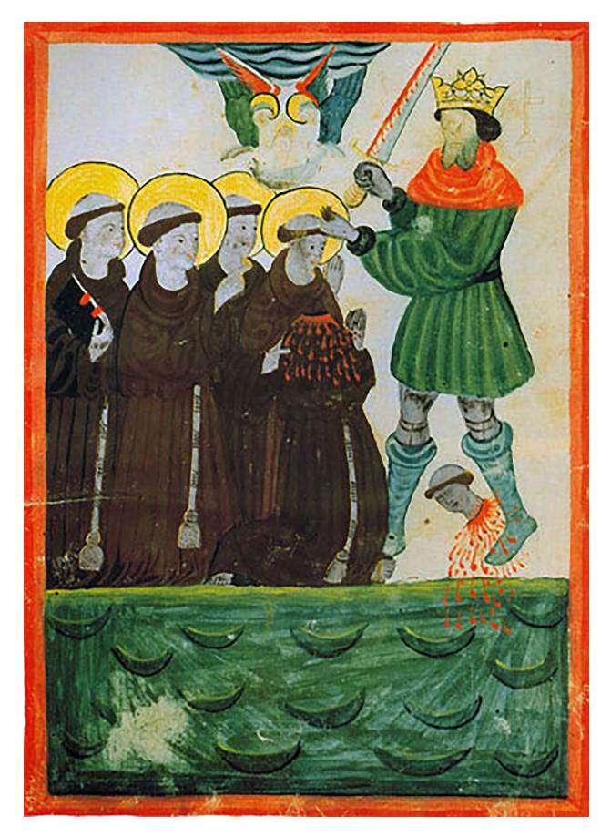
Illustration 2. Beheading of the five martyrs of Morocco. Coimbra workshop-monastery of Santa Cruz of Coimbra (?). Fifteenth century. Illuminated parchment. Dimensions: 25.8 cm height x 17.9 cm width. folio dimensions: 38 cm height x 25.5 cm width. Original location: monastery of Santa Cruz of Coimbra. Current location: Biblioteca Pública Municipal do Porto (inv. no. Santa Cruz 38- general no. 770, folio i v).

translation of the oldest relation from Latin into Portuguese, complemented with the ancient texts of the royal chronicles<sup>50</sup>. He entrusted the task to an anonymous writer —certainly an Augustinian canon from his own community—, the same one who admitted, in a critical tone, that in the distant thirteenth century there was no care in describing and perpetuating subjects as glorious as this, which is why many