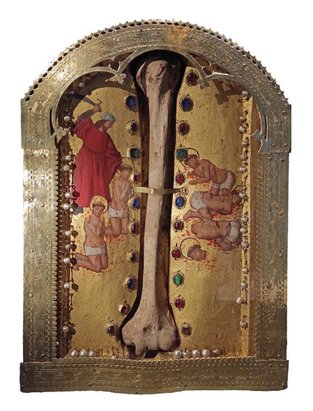
ILLUSTRATION 7. RELIQUARY-ORATORY OF THE MARTYRS OF MOROCCO. COIMBRA WORKSHOP - HENRIQUES DOMINGUES AND ANTÓNIO DOMINGUES. 1514. SILVER, GOLDEN SILVER, PEARLS, WOOD AND BONE RELIC. DIMENSIONS: 36 CM HEIGHT X 26.6 CM WIDTH. X 6 CM DEPTH. ORIGINAL LOCATION: MONASTERY OF SANTA MARIA DE LORVÃO. CURRENT LOCATION: MUSEO NACIONAL DE MACHADO DE CASTRO (INV. NO. 6089 / O23). ILLUSTRATION PROVIDED