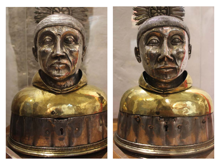
Illustrations 4-5. Reliquaries-busts of the martyrs of Morocco at the Santa Cruz monastery. Coimbra workshop – João Rodrigues. C. 1510. Silver, golden silver, iron, glass and damask fabric – bone relics. Dimensions (left bust): 32 cm height x 21,5 cm wide x 12.5 cm deep. Dimensions (right bust): 31 cm height x 20 cm wide x 13 cm deep. Original and current location: monastery of Santa Cruz of Coimbra.

The rigor and accuracy of some anatomical features allow the identification of two distinct individuals, both friars with tonsure wearing a Franciscan habit,