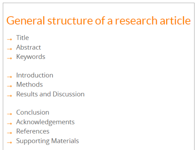
Figure 1. IMRaD structure of a scientific article.

As in this illustration, the following is the IMRaD version of Elsevier that shows what was pointed out in the previous paragraph about the need to understand this model as part of a broader structure: