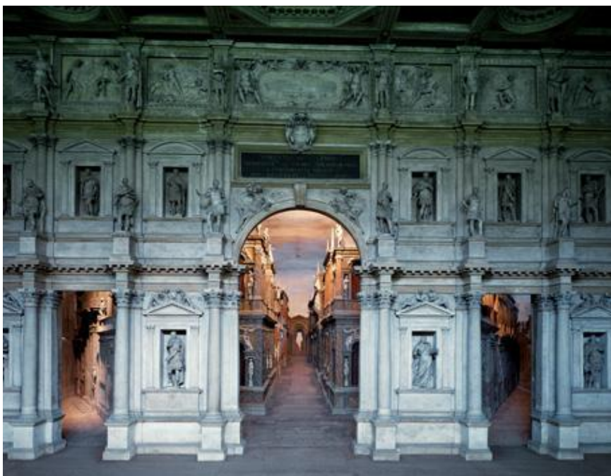
Fig 4. Andrea Palladio, Teatro Olimpico , 1584.

Some earlier history: In ancient Greece the original stage sets amounted to an assortment of unassuming structures placed on a raised wooden plank platform. The entire production, including theater, stage and audience area, had a temporary feel to it; the sets could be assembled and disassembled in response to the needs of the performance or of the viewing public. Among these structures was an unpretentious hut, a model of the king's residence. This transient architecture was referred to as the skene , from which word has come the term scenography, i.e. the portraying of skenai – the stage huts. The connection between theater sets and architecture was to be even more elaborately considered in imperial Rome, where the stage was sealed off with a fixed marble construction, the scaenae frons , which simulated a palace façade, the gateways of which permitted the passage of masked performers overshadowed by the imposing décor.