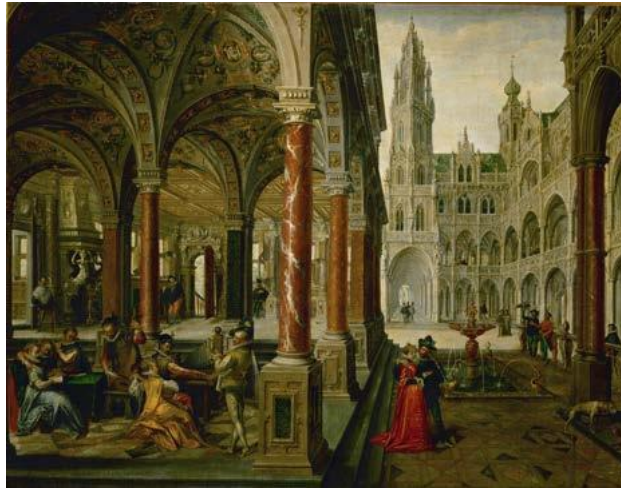
Fig. 01. Hans Vredeman de Vries, Palace Architecture with Musicians , 1596.

There were reasons why this schism should come about during this time period. Something interesting in the background might have enabled those distant views each to become a self-sufficient subject. More importantly, the images of this genre were very much intended to delight their audiences, not to inspire them with religious admiration and fervor 2 . The method of patronage had changed as well, for members of the nobility or well-to-do citizens would most often simply commission the works directly from the artist's studio.