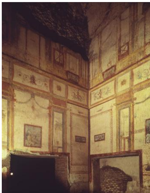
Fig 5. Fabullus, Fresco at Domus Aurea, 64-69 A.D.