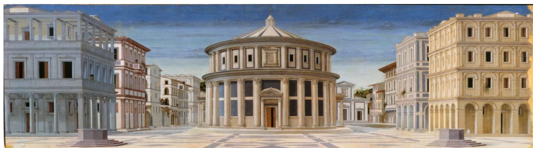
Fig 3. Panel in Urbino, View of an Ideal City, c.1470.

The depiction of architecture in painting was not unfamiliar to the Renaissance, during which time art was being commissioned less and less by the Church. As evident in a work such as Piero della Francesca's fifteenth-century perspectival panel in Urbino (fig.3), buildings and civic spaces were clearly of thematic concern at the time. Up until the Enlightenment, the majority of these works would not take architecture as their primary theme, but as a backdrop for narrative drama. Much as in landscape paintings, these architectural backgrounds provided supporting settings for the unfolding narrative of each picture. Actual constructed buildings, such as houses or palaces, still remained largely the province of religious paintings.