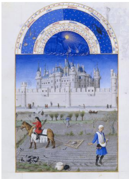
Fig 6. Limbourg Brothers, October from Les Très Riches Heures du Duc de Berry, 1412-1416.