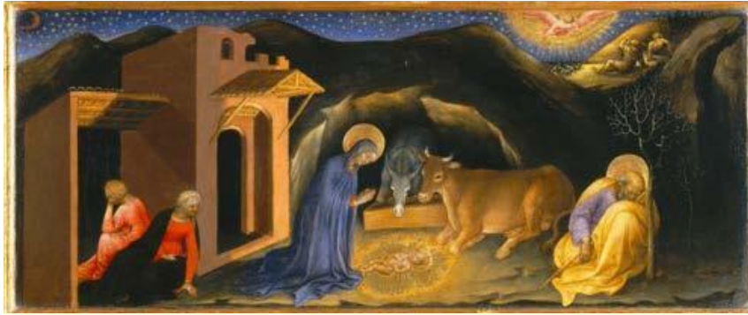
Fig 7. Gentile da Fabriano, Nativity from Adoration of the Magi, 1423. Credit: Scala/Ministero per i Beni e le Attività culturali / Art Resource, NY

Significantly, this suggested that human beings should not have striven for a pretentious rivalry with perfection. A further implication remains that architecture cannot provide humankind with a community – only God could supply this. The building as a center of a genuine society fails because of God’s intervention – which in turn occurs because of man’s pride. In most illustrations of this event, the tower dominates and disregards the city at its base, and draws a sharp distinction between the vertical and the horizontal. The job of humankind was not to pierce the clouds with towers, but to do something more modest. Cloud piercing represented an attempt at engaging the firmament, or the Spirit, in combat. That kind of rivalry leads persons away from a concern regarding shadows.