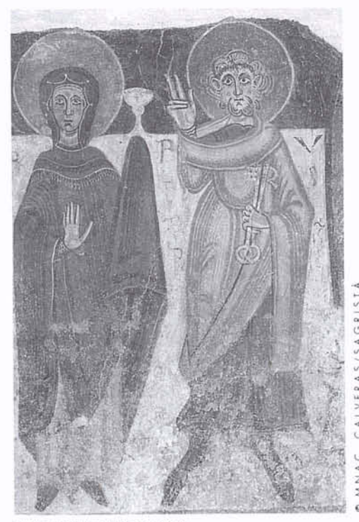
SANT MIQUEL D'ENGOLASTERS

Whenever people speak of the artistic manifestations which over the ages have gradually shaped our "material culture", they always put a special emphasis on the period between the ninth and thirteenth centuries. This historicoartistic period represents a moment of intense historical activity in the terri-