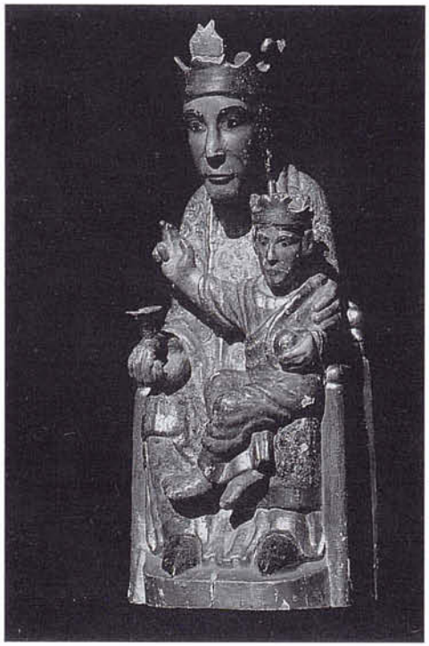
VIRGIN OF SANTA COLOMA (XII-XIII C.)

The functionalism and simplicity of these constructions are features that lasted for centuries and survived the end of the medieval period.