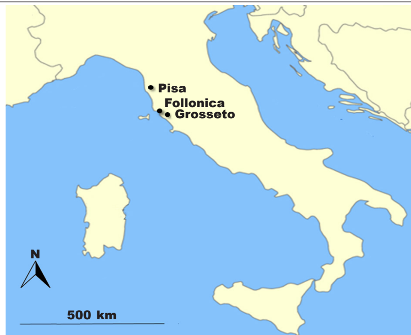
Fig. 1. Location of the study area (Follonica) and the control areas (Grosseto and Pisa).

Fig. 1. Ubicación de la zona de estudio (Follonica) y las zonas de control (Grosseto y Pisa).