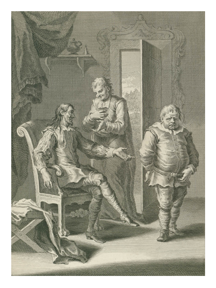
Figure 2. John Vanderbank (illustrator) and Gerard van der Gucht (engraver), Sansón Carrasco proposes himself to be don Quixote's squire (London, 1738; III: 60). Burin engraving/etching (acquaforte). Cervantes Project. Cushing Memorial Library, Texas A&M University.

from above. Although the engraving alone fails to represent such an ample range of emotions, it does succeed, per Oldfield's prescription, in presenting a diversity of countenances and poses that serves to complement that of the text. Furthermore, by allowing us to picture the quantity of character-spectators present, the image may grant us a greater appreciation for the frequent importance of an intradiegetic audience in scenes of conflict or affective intensity of the novel, through which I would argue our own emotions as readers are channeled and intensified even further. In effect, it is the sentiments of pity and empathy we might be most likely to feel upon viewing Vanderbank's depiction of the dialogue at the beginning of the Quijote of 1615 in which Sansón Carrasco offers himself as the knight's new squire (Figure 2). The attention to gestures, detailed facial expressions, and bodily postures indexes the status and relationships of characters in the scene while manifesting the material qualities of what in this case is Carrasco's performative fawning and, especially, Sancho's sense of rejection and betraval. Even more significant to note is how emotions continue to play a major role in what would typically be considered only a minor scene of Cervantes's novel. These images thus subvert conventional readings by introducing an alternative layer of literary reality for the viewer.