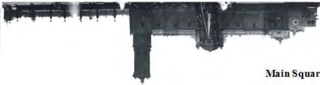
Main Square (zócalo)