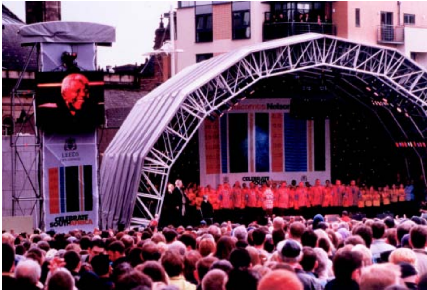
Nelson Mandela officially opens Millennium Square and new Mandela gardens.