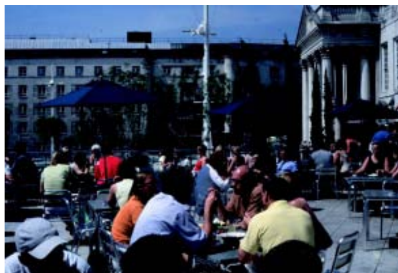
Open air tables at the café bar in Millennium Square