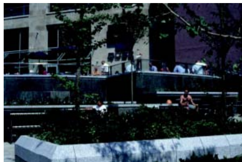
Growing plantation display in Millennium Square.