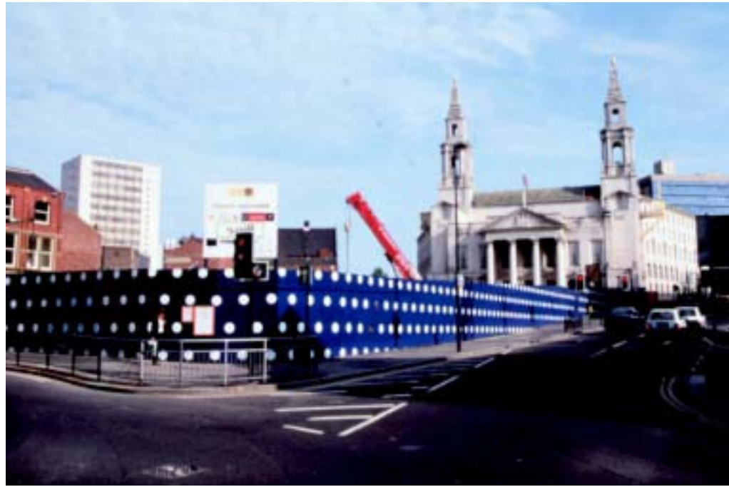
Building site screen erected while the building of Millennium Square was in progress.

An oral history project, also run by Pavilion, involved the recording of memories and conversations by workers from the old disused factories and warehouses around the perimeter of the square, highlighting and archiving past lives