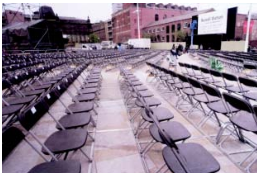
Temporary seating for a Millennium Square music concert.