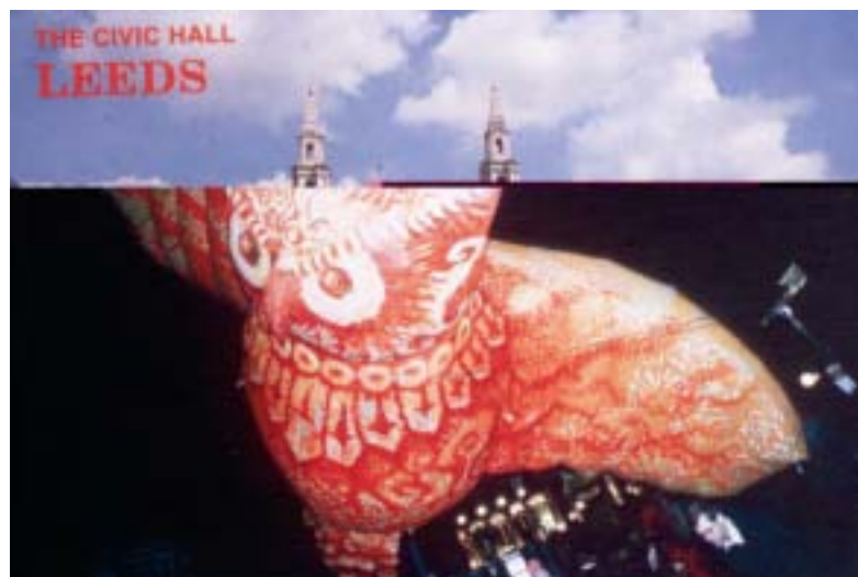
The area in front of the Leeds Civic Hall showing the original Mandela Gardens and the site that was to be occupied by the new Millennium Square .

One of the proposed squares lay in front of the Leeds Civic Hall, which completed in 1933, houses the official departments of the Leeds City Council, providing the council debating chamber, the Mayor's offices, reception rooms and offices for much of the bureaucracy of local government. The area also contained formally designed sunken gardens, which in 1983 was named as Mandela Gardens, symbolic of a political radical stance displayed by the controlling Labour Party city council, and which also marked several links that the city had in actively supporting the anti-apartheid movement. The area in front of the Civic Hall had not changed for 63 years and was surrounded by buildings, some like the Leeds General Infirmary hospital in the public sector, others such as The Electric Press,