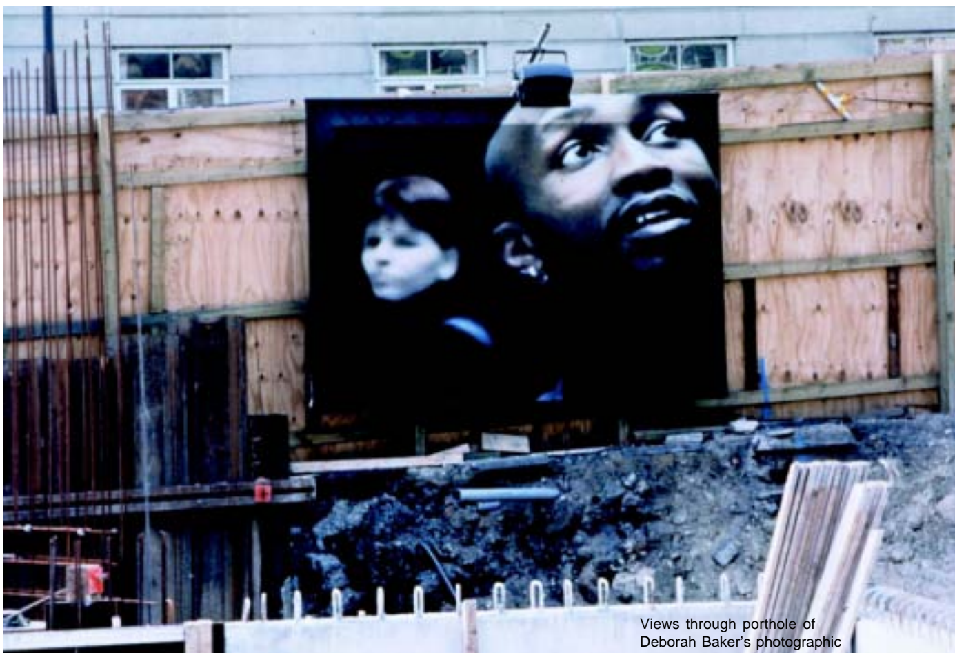
Views through porthole of Deborah Baker's photographic installation.