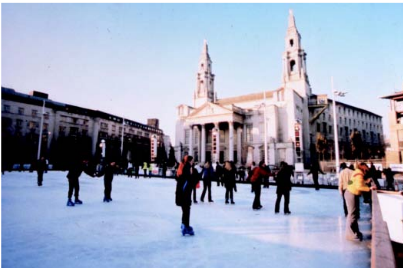
Temporary ice rink in Millennium Square.