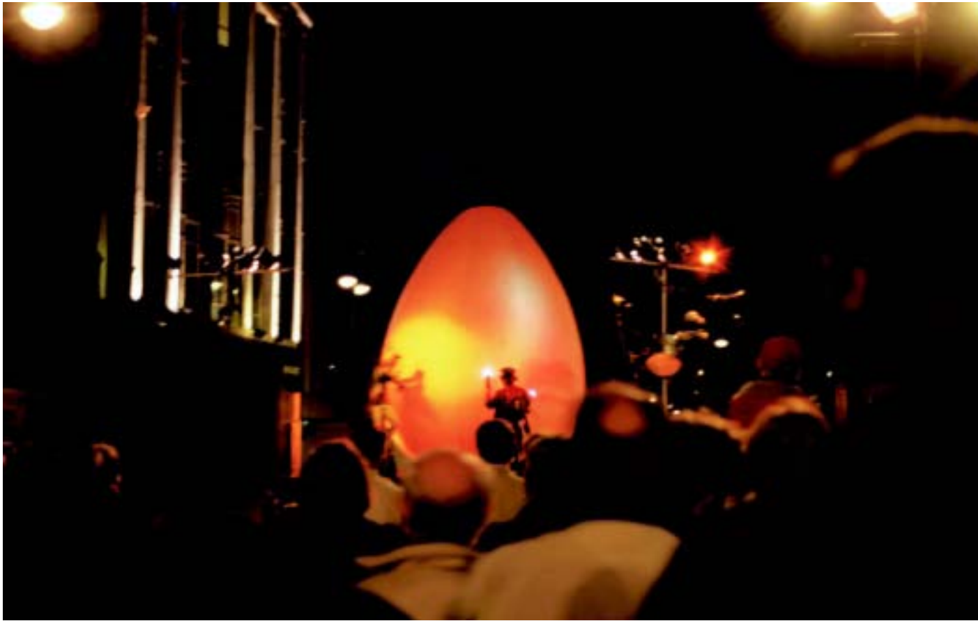
Beginning of Street theatre performance / fireworks by L'Avalot, on the way to Millennium Square.