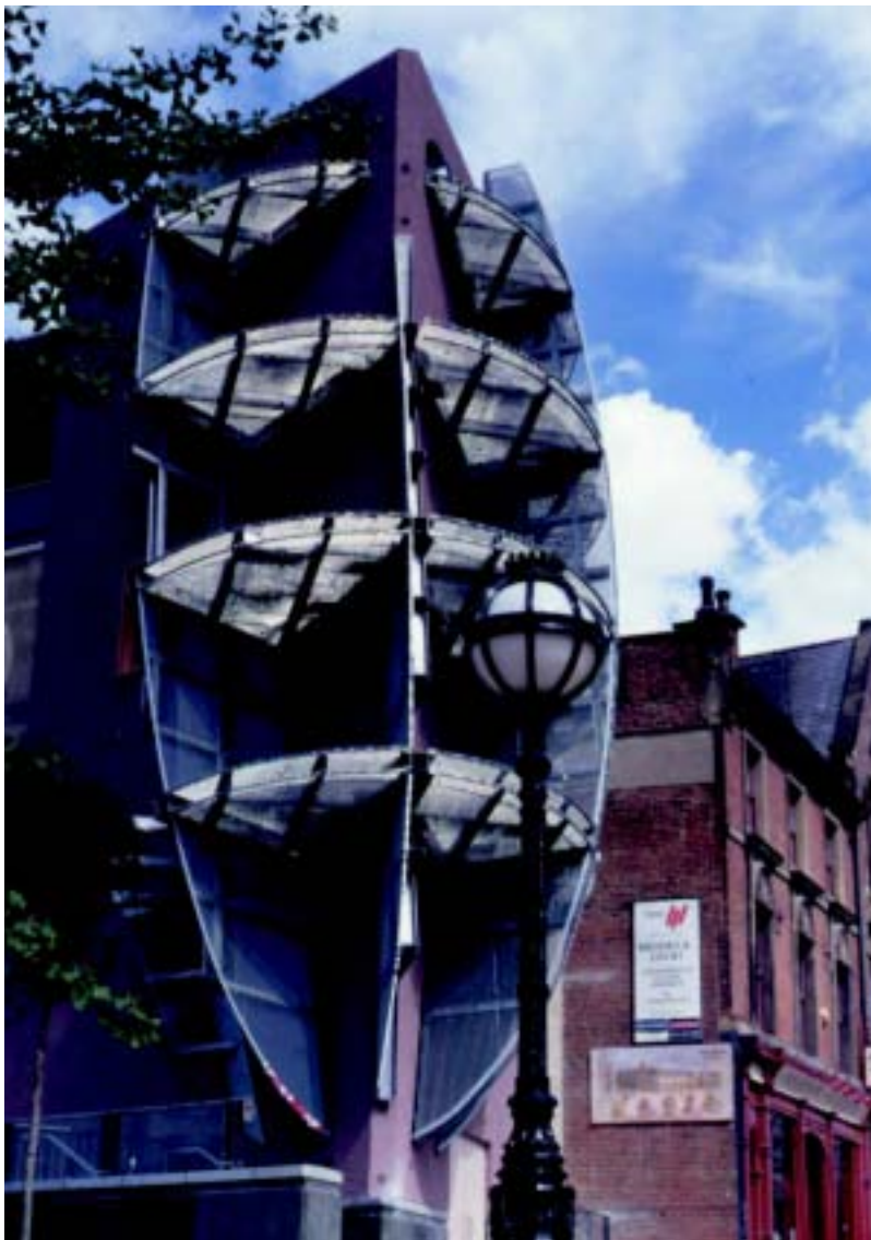
Sculpture by Richard Wilson