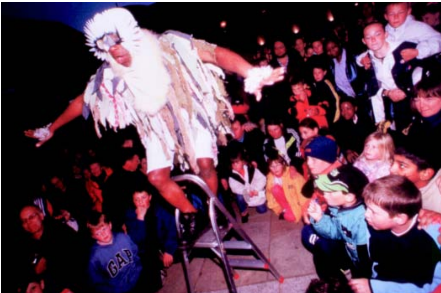
Scene from performance by Plasticiens Volants in Millennium Square