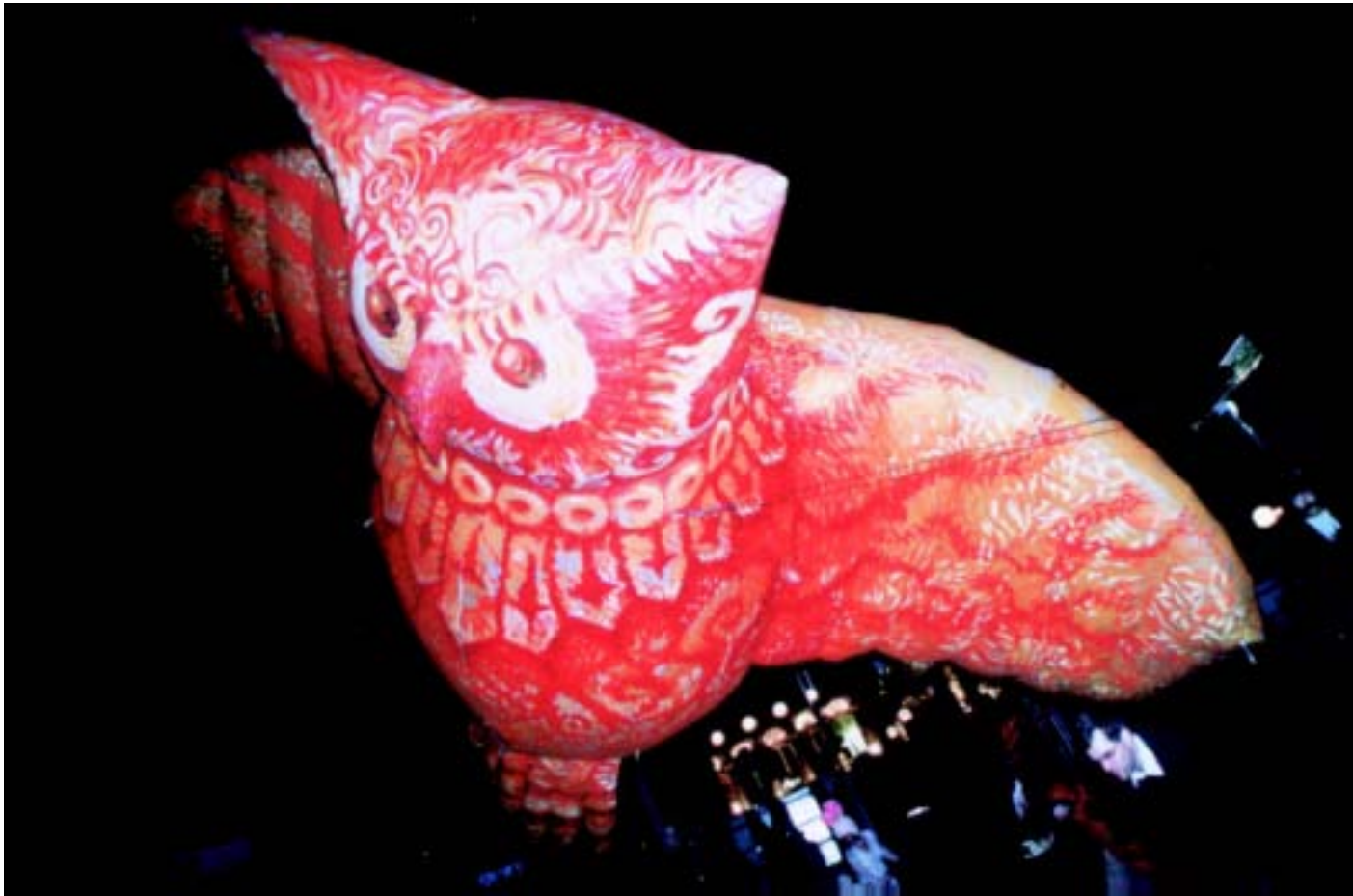
Giant inflatable owl, part of performance by Plasticiens Volants in Millennium Square