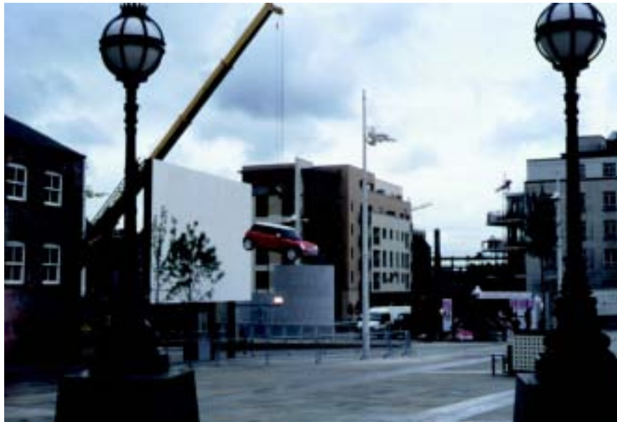
Promotional private sector event for car promotion in Millennium Square.

Unofficially it seems that anyone can spontaneously use the square for an arts performance or event, although such could be prevented if considered a threat to the environment and fabric, the health and safety of others and so on. For example, students from the nearby Universities and colleges could gather unannounced for spontaneous arts events, and the square has already been used for political protest by way of a demonstration against the closing of care homes by the Council itself. It is likely it will become the focus of other political gatherings of one sort or the other.