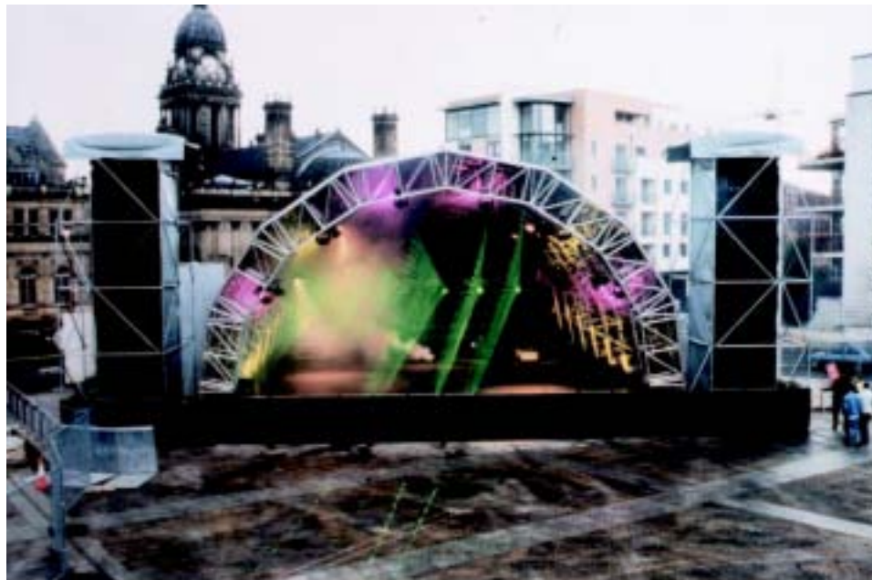
The portable stage at Millennium Square with a test display of laser lights.