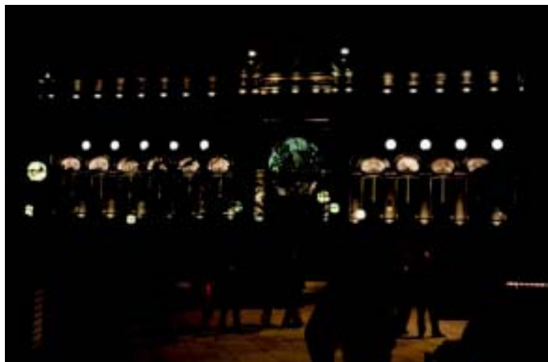
Night view of refurbished Leeds Institute Building, situated on the perimeter of Millennium Square.

Any future or on-going evaluation of Millennium Square will require a range of interdisciplinary methodologies, taking into account its history, ethnographic aspects, aesthetics and design functions, and above all how it was socially produced and constructed by its users and potential users. Indices other than the economic will need to be used to account for the socio-political aspects of the space. For example, there will be the need for some mapping and usage profiles to highlight class, gender, age, and disability to assess whether the square is truly an inclusive public space, or whether it is dominated by a particular social stratum by both use and by the nature of its users. There will also be the need for participant observation and the collection of narratives to highlight its emerging expressive and