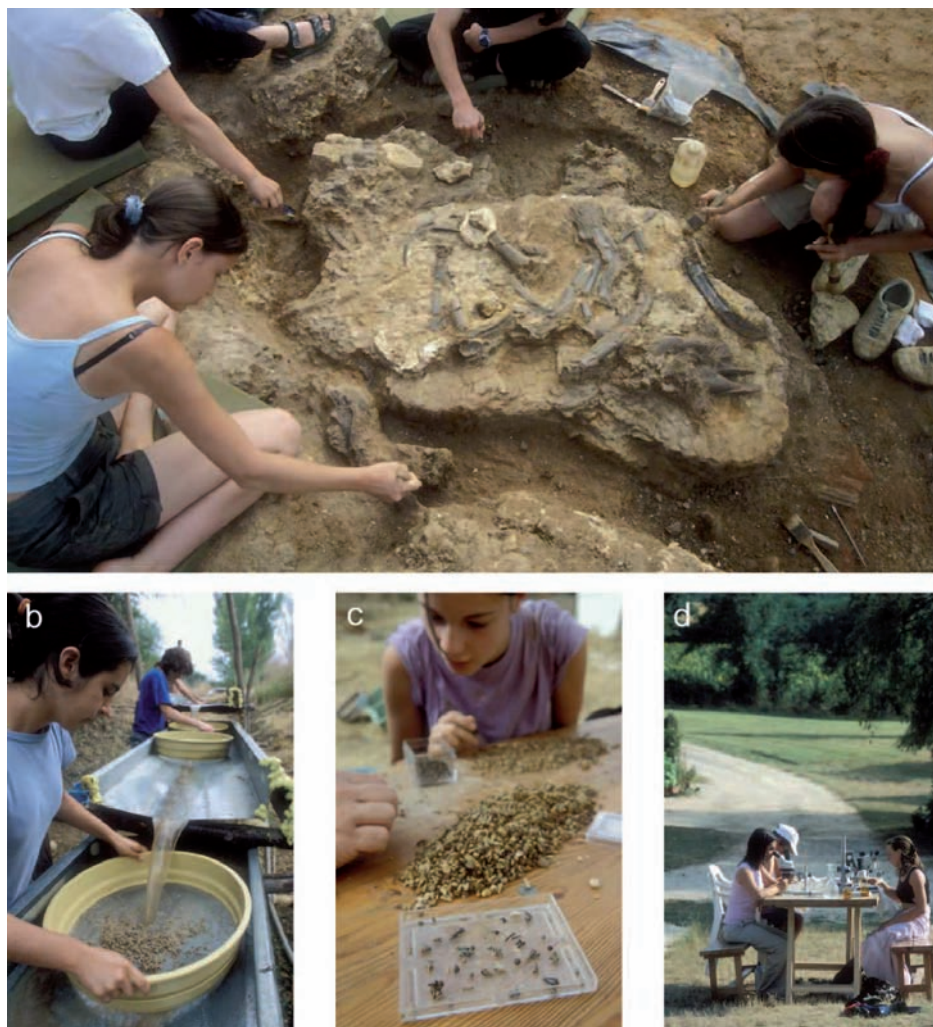
Figure 4. Teenagers and university students in a real paleontology excavation during a work camp. Work camps promote learning the scientific methodology by discovering it. The teenager or university student is the only responsible; he/she follows all the stages until the transference of the fossil to the Natural History Museum of Toulouse: a) bones accumulation dug out by teenagers and university students; b) screening tasks; c) identifications tasks made by naked eye, and d) examination with magnifying glasses.