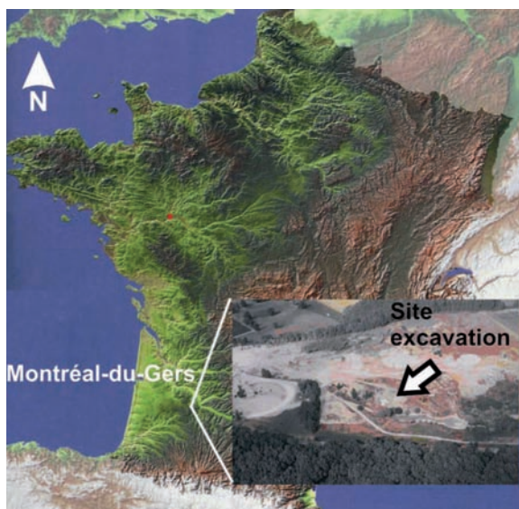
Figure 1. Emplacement and aerial view of the palaeontological site of Montréal-du-Gers (Gers department, Midi-Pyrénées region, France). The site was found by accident in 1987 during the mining of the limestone next to it (Duranthon, unpublished).

This way, we are able to point out the different scales and different kinds of remains palaeontologist deal with. The structures of habitat and the traces of human activity are absent. However, timelines overlap some times, and it is then difficult to define the border line between the time of palaeontology and time of archaeology.