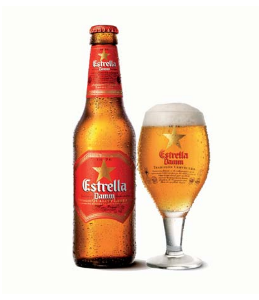
Advertising by Estrella Damm is associated with our way of doing and living.

The idea of exporting our lifestyle is not new. In fact, there are companies using this strategy successfully. They are in different industries because as opposed to other identity-based commercial strategies, adding value to products by means of an intangibles like the feeling of living in a specific way can be exported to most productive segments. The quality of Japanese