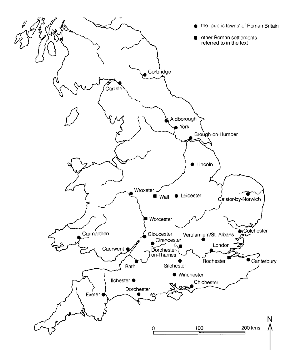
Fig. 1. Towns in Roman Britain.