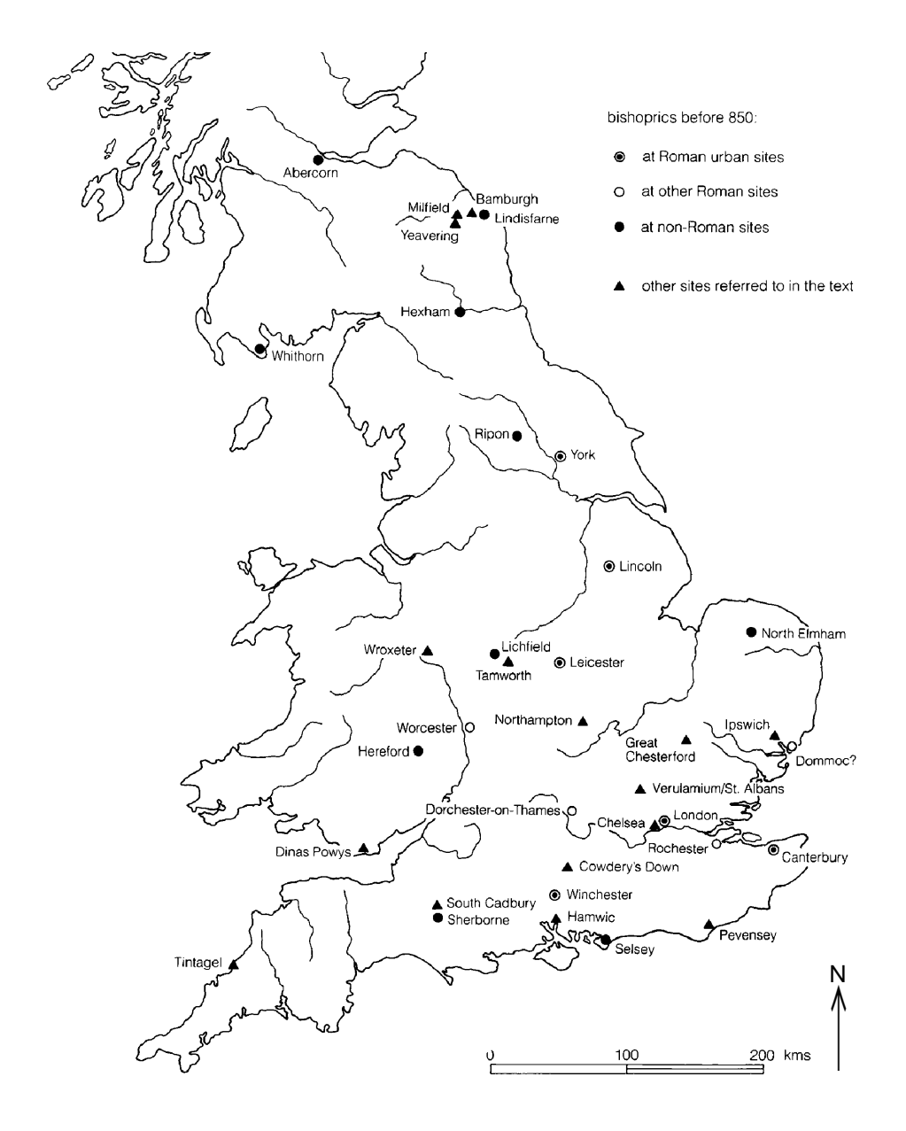
Fig. 3. Post-Roman and Anglo-Saxon settlements.