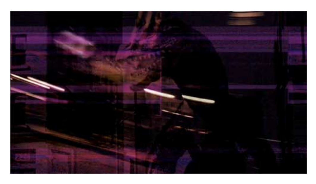
The Beast from de 20000 Fathoms (Eugène Lourié, 1953)

Madagascar that they thought had been extinct for centuries (...) Maybe it erupted from an ocean trench, you know? Or a crevasse. Crevice. It's just a theory (cited from Godzilla , "Gojira", Ishiro Honda, 1954). I mean, for all we know, it's from another planet and it flew here." Hud is referring to the gigantic creature whose destructive, demolishing movements are causing such havoc in New York as caused by the prehistoric monster awakened by a nuclear explosion in the Arctic of The Beast from 20000 Fathoms ("Le monstre des temps perdus", Eugène Lourié, 1953). But the city also suffers the plague of thousands of repulsive animals which look like hymenopteric insects measuring a metre or a metre and a half, armed with poisonous claws, bugs that are slightly smaller than the mutant ants in Them! (Gordon Douglas, 1954). Cloverfield conceals photograms of the radioactive monsters of these two films, as well as one from King Kong (Merian C. Cooper and Ernest B. Schoedsack, 1933).