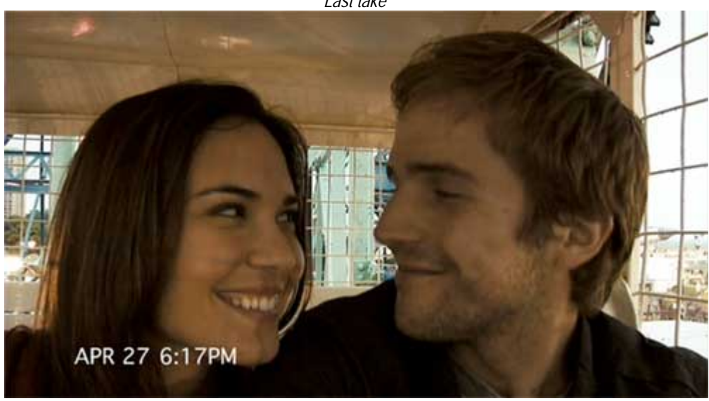
Second Recording (eraser tape): From 6:43~p.m to 6:42~a.m (From the afternoon of May 22nd until the sunrise of May 23rd)