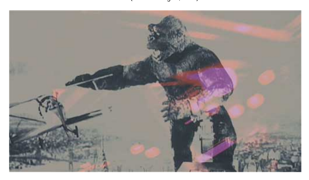
King Kong (Merian C. Cooper and Ernest B. Schoedsack, 1933)

But Cloverfield , as a science fiction monster film, it is, at least, atypical, because the main plot has absolutely nothing to do, not even tangentially, with the paradigmatic plot of the genre's archetypal films such as those cited: Godzilla , The Beast from 20000 Fathoms and Them! Indeed, in the films of monsters that threaten a city or the entire human race, the whole plot revolves around the efforts and means deployed by the governments, aided by scientists (there is always an eminent scientist who advises the authorities), in order to defeat the monster. In Cloverfield there are no politicians or authorities or scientists to be seen. Just the army. In fact, the plot of Cloverfield neither proposes nor