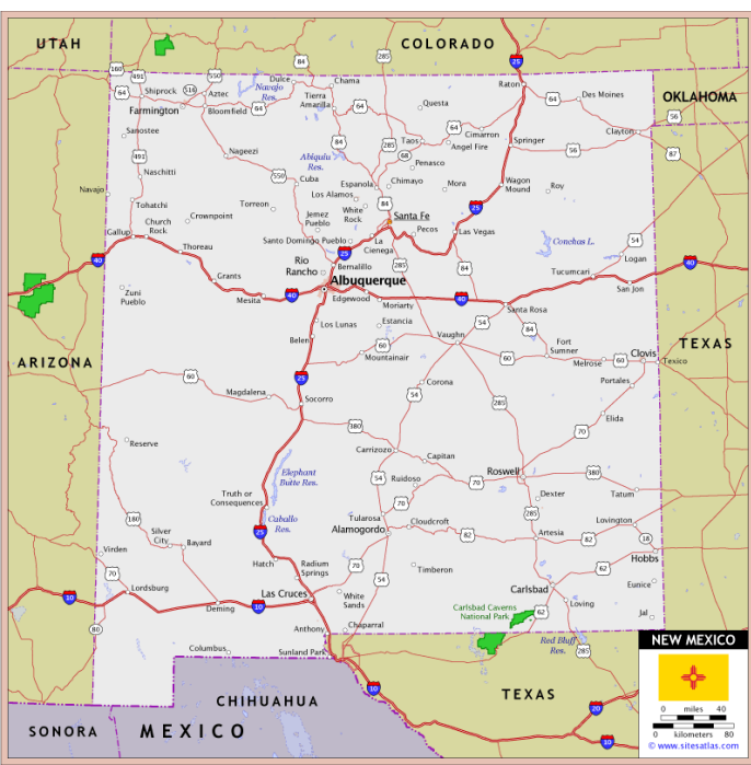
Figure 1. Map of New Mexican Cities and Towns

Spanish expeditions leaving from New Spain (now Mexico) scoured the southwest of what is now the United States throughout the early part of the sixteenth century. The first permanent settlement in this region was not until 1598, however, near present-day Española, New Mexico, which is located about 25 miles northwest of Santa Fe, as shown in Figure 1.