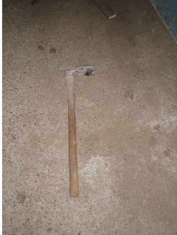
Figure 3. Krčevka