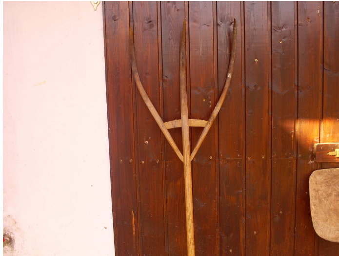
Figure 5. Razsohe

wire mesh used for sifting grain, a sieve ← the PS. *rešetò originally meant *'something knitted' and is derived from an IE. root;