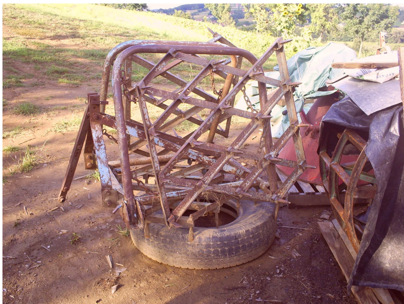
Figure 1. Brana

originally meant *'an agricultural tool for cutting or threshing grain to separate it from the husk' (Snoj, 2003: 71);