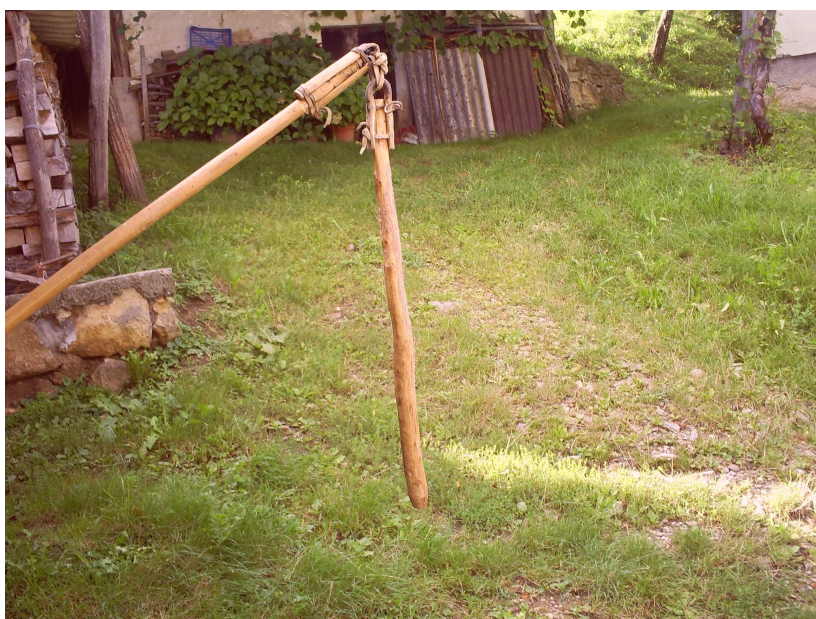
Figure 2. Cepe

črtalo || 'črtalo -a n a part of the plough that draws the furrows vertically ← Bezljaj (1976: 89) traces the word to the PS. *čersti, čbrtq 'to cut' which is derived from an IE. root with identical meaning; glava || g'la:va gla've:ĩ f part of the sheaf with ears ← the etymology of this word is