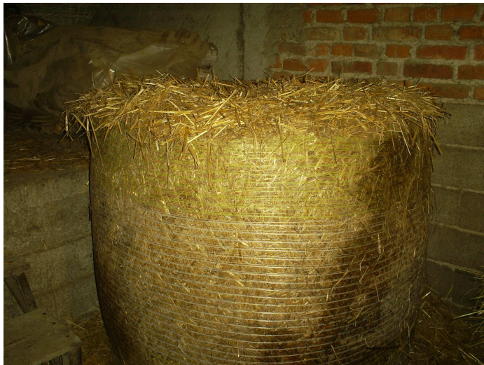
Figure 7. Bala

ajdina || e'di:ina also i'di:ina -e f a cultivated plant with reddish or white blossoms in thick inflorescence or its seed ← OG. Heiden; bala || 'bāla -e f a large bundle of hay (a hay bale) bound for storage or transport, hay ← G. Strohball; bintelj || 'binteɹ -tla m a machine or device for eliminating chaff or foreign matter from cereals; a winnowing machine ← G. Wind-; burgula || 'burgola -e f a cultivated plant with large leaves growing from the rhizome or its yellowish or pale red fleshy underground part; fodder beet ← G. Burgunderrübe; cvek || c'vek -a m a nail in the axle preventing the wheel from slipping or falling off the axle ← MHG. zwęc; gepelj || 'gɛ:pɿ -na m a device for rotating the drive shaft propelled by draught animals; a windlass ← G. Göpel; graba || g'rāba -e also gra'bɛ:ɿ f a hole for storing turnips in winter ← OHG. grabo, MHG. grabe;