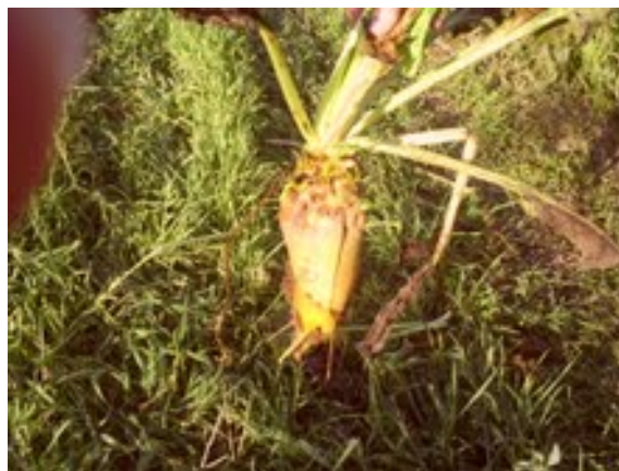
Figure 8. Burgola