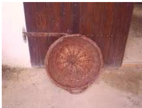
Figure 12. Korbelj

kvatre || k'vatre k'va:ter f pl. a large stubble rake ← Rom.; lucerna || lu'cerna -e f a forage plant with triple leaves and clusters of small purple flowers, alfalfa (Medicago sativa) ← G. Luzerne ← Fr. luzerne ← Lat. lūcerna ; mašin || ma'ši:ɲ -a m 1. a device for planting ; 2. a threshing machine ← G. Maschine , Fr. machine ← Lat. māchina ← OGr.; sirek || 'sirek -rka m a cultivated plant similar to corn (Zea mays) with cyme type inflorescence and tiny seeds, or its seed ← med. Lat. syricum ; traktor || t'råktor -a m a motor vehicle used to pull heavy loads, especially farm implements, a tractor ← G. Traktor ← Lat. tractor .