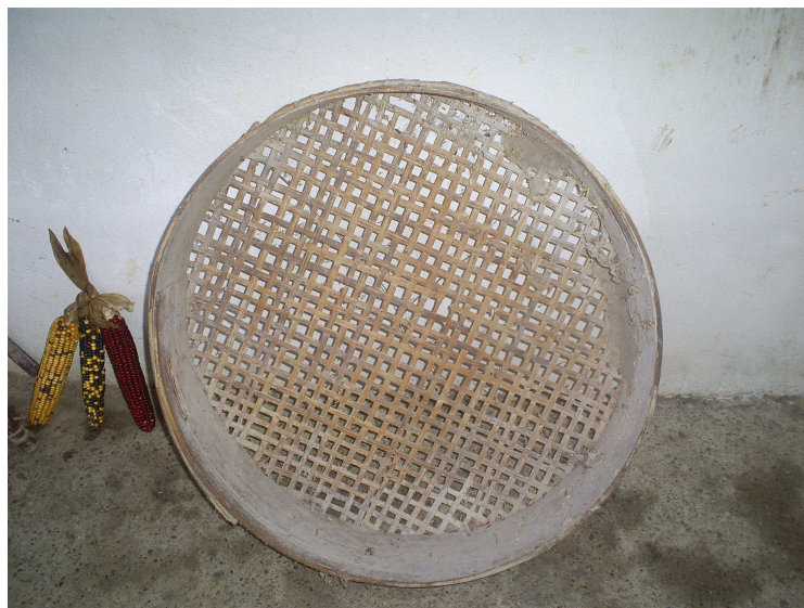
Figure 6. Rešeto

rogelj || ro'gɛɫ roɡ'la: m each of the parts of wooden hay fork, used for thrusting, a tine ← derived from the root rog , originally meaning 'the jutting out part'; saditi || sa'ditɨ sa'di:ɨn imperf. to set plants in the ground for growth, to plant ← PS. *sadĩti is a causal verb is derived from the PS. *sěsti , originally meaning *'to cause something to sit'; sečka || 'sɛčka -e f