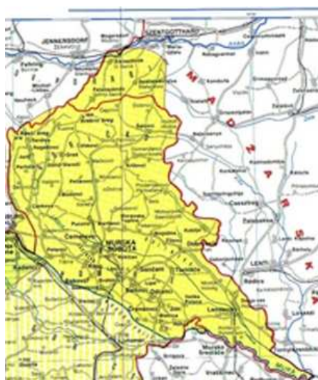
Map 4. Prekmurje dialect

The Prekmurje dialect is divided into three sub-dialects: the northern (Goričko), central (Ravensko) and southern (Dolinsko) sub-dialect. These differ according to elements in recent Prekmurje dialect development: (a) various acoustic realizations for the long and short a ; (b) development of the final -l into -o or -u ; and (c) pronunciation of the sonorant j in the southern and partially in the east-central part of the sub-dialect as j , while older phonetic and morphological developments remain rather uniform. There are no intonational oppositions in the Prekmurje dialect; the accent is dynamic, and quantitative oppositions are preserved. Long and short unstressed syllables can appear in all syllables of multisyllable words. The long open proto-Slavic vowel ja gradually narrowed into the diphthong eĵ , whereas its phonological pair, the proto-Slavic long o , narrowed into the diphthong ou . Further particularities of the Prekmurje dialect are front rounded vowels ü for u and ö for e , u in the position next to the voiced consonants v and r and the pronunciation of the voiced consonant j as dj , tj , kj , dž or g in accordance with specific phonological proximity.