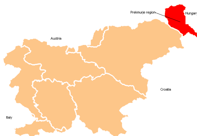
Map 1. Prekmurje region

The lowland and agricultural region of Prekmurje lies in the easternmost part of Slovenia and borders Austria and Hungary on the left bank of the River Mura, after which it takes its name.