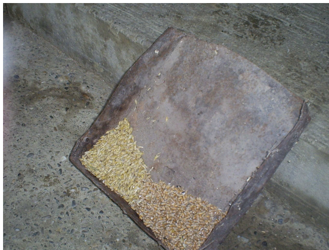
Figure 10. Šavfla

šker || š'kɛ:jɾ -i f a tool ← OHG. giskirri , MHG. geschirre ; šinja || 'šinja -e f the iron outer part of a felloe ← G. Schiene ; špic || š'pic -a m each of the tines of an iron pitchfork used for pitching ← MHG. spitze ; šprickati || šp'rickatj -an imperf. to sprinkle ← G. spritzen ; štala || š'tâla -e f a stall ← MHG. stal , -lles; šteslin || š'tɛ:jslin -a m the end part of the cart axle (cap) with two inserted nails preventing the wheel from slipping or falling off the axle ← G. Stössel ; štil || š'tiɥ š'tüla m a handle (of a mattock, rake, or a shovel) ← G. Stiel ; štranga || št'ra:nga -e f a rope for harnessing animals to a cart or a plough; a rein ← MHG. strange ; štroštok || št'rɔš'tɔk -a m a strawcutter ← G. Strohstock ; šuber || 'šuber -bra m trapdoor of a grain chest