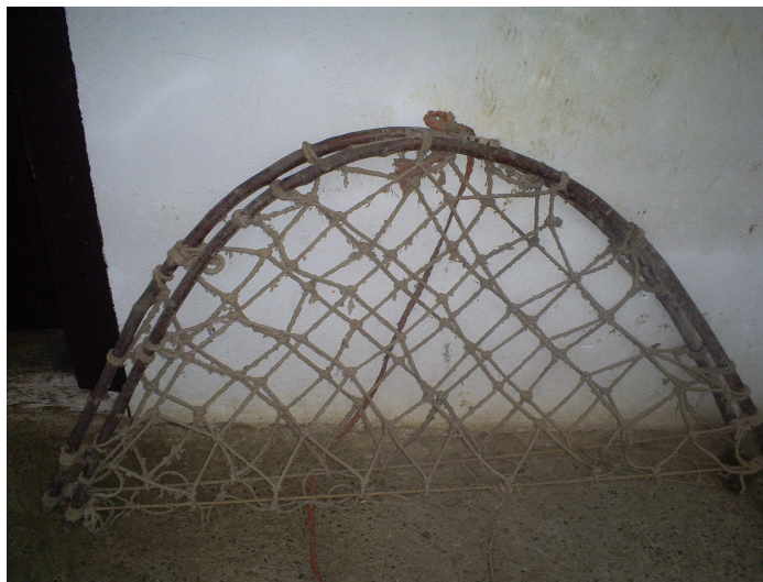
Figure 4. Locne

lopata || lo'pâta -e f a long-handled tool with a broad scoop for ladling or scooping loose material, a shovel ← general Slavic word originally meaning *'equipped with a scoop, with a flat part (for ladling)'; luščiti || 'lu:ĩščiti 0 -in imperf. to remove grains from the cone, to husk ← PS. *luščiti is