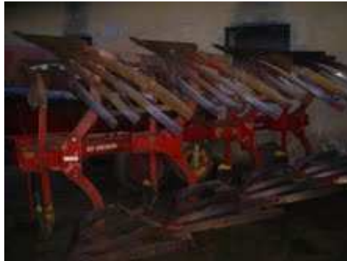
Figure 11. Freza

korbelj || 'kɔrbeɟ -bla m a container made of interwoven material and with a handle, a basket ← MHG. korbe ← Lat. corbis ;