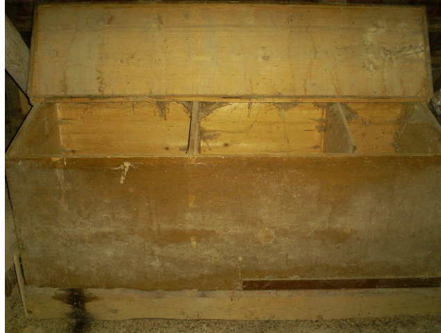
Figure 9. Lada