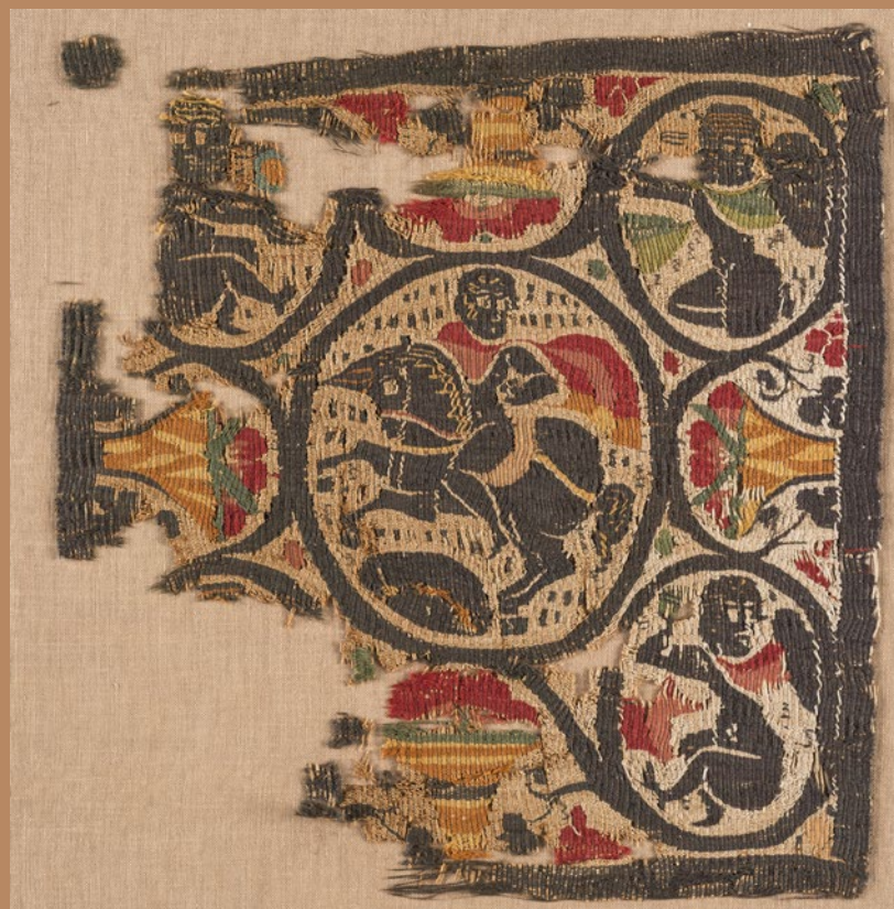
CDMT n.r.245, 5th-6th c. See details.