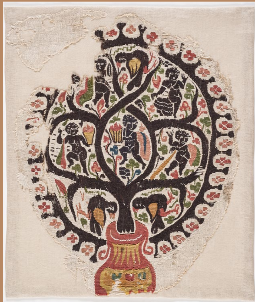
CDMT n.r.222, 5th-6th c. See details.