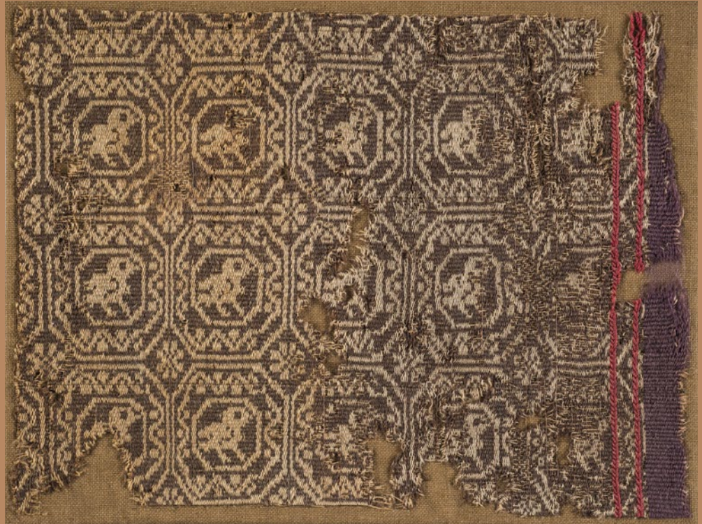
CDMT n.r. 304, 3rd-5th c. See detail.

16 Textile restorer and researcher, respectively, attached to the art collection owned by Katoen Natie, Antwerp.