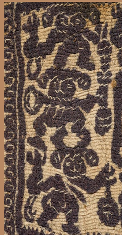
CDMT n.r. 7495, 6th-7th c.

18 We have not included in this group the first-century Egyptian textiles donated by the Monastery of Montserrat.