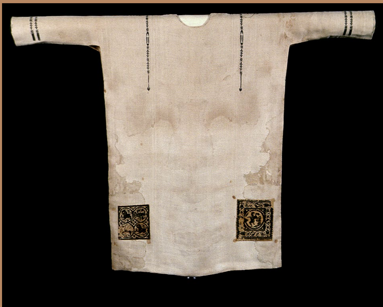
CDMT n.r.263, 4th-6th c.