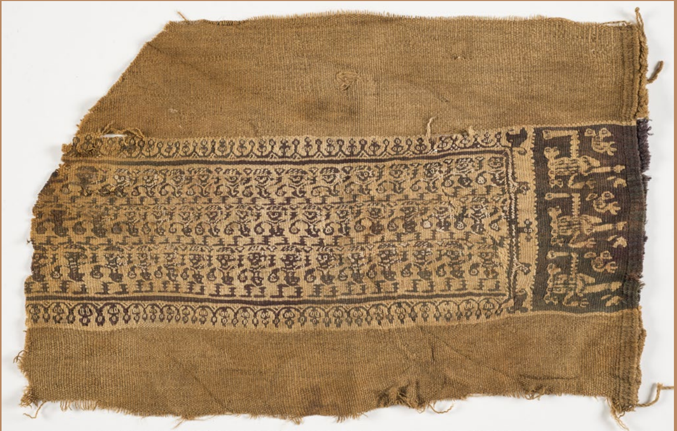
CDMT n.r.7509, 6th-8th c. See detail.

In February 2017 the CDMT will host the exhibition “Ancient Egypt and the Coptic Textiles of Montserrat,” curated by the Fundació Abadia de Montserrat, which showcases pieces from the Roca collection, and an exhibition of photographs taken at excavations in Oxyrhynchus, organised by the Catalan Society of Egyptology.