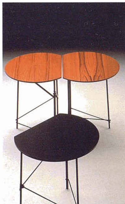
ZAHRA T 20-40 SIDETABLE. PEPE CORTÉS.