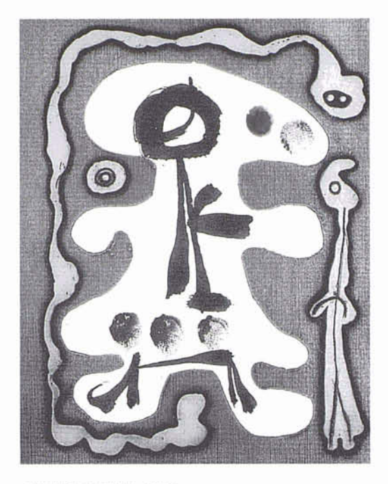
L'ANTITÉTE DE TZARA, 1947