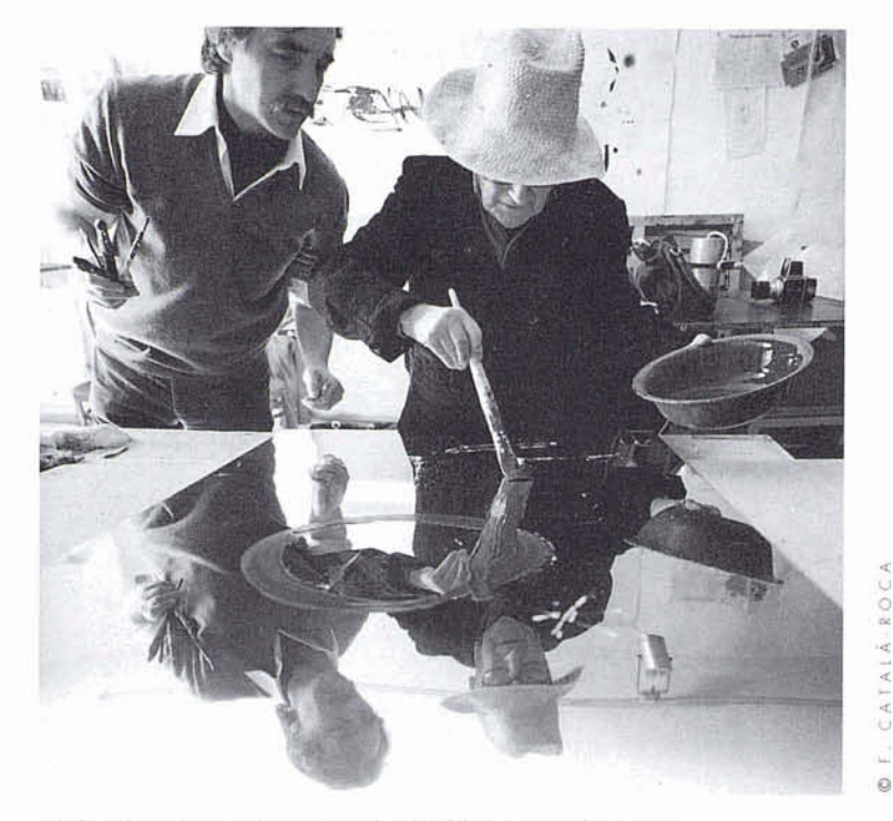
MIRÓ AT WORK WITH JOAN BARBARÅ. SON BOTER, MALLORCA, 1979

FOR MIRÓ, PRINTMAKING WAS A TECHNIQUE, LIKE PAINTING OR SCULPTURE, RULED BY LAWS OF ITS OWN. FROM CHISEL TO DRY-POINT, FROM ETCHING TO AQUATINT, FROM SOFT VARNISH TO CARVING, THE ARTIST EXPERIMENTED EXHAUSTIVELY, INVENTING VARIATIONS AND TECHNIQUES WHICH HE OFTEN COMBINED, IN A PROCESS THAT WENT FROM THE FIGURATIVE ART OF THE THIRTIES TO PURE ABSTRACTION.