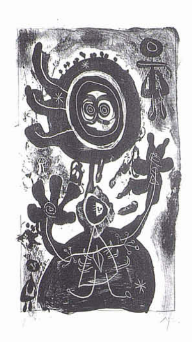
GRAN PERSONATGE NEGRE, 1938